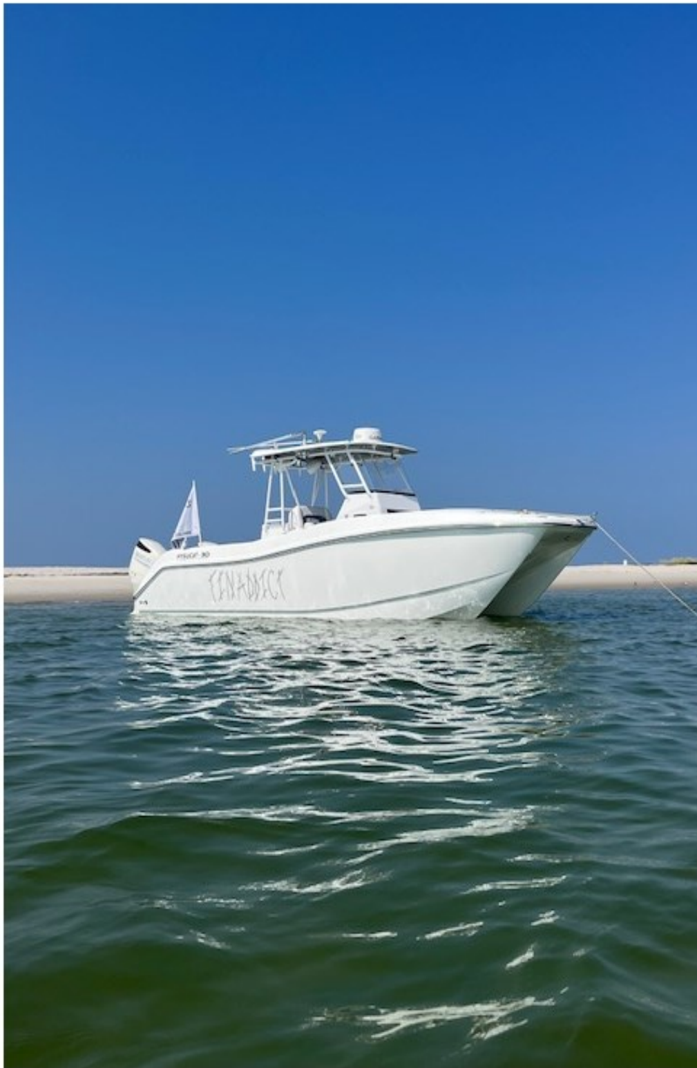
Finaddict cooling her hulls at Ship Island