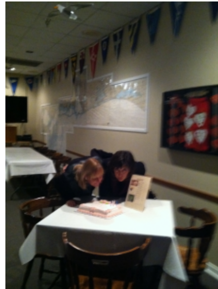
We will get them all OUT.....

Please make your reservations by the Thursday PM preceding each of the above dates to properly order adequate food. Come out and enjoy the beautiful fall weather and share the camaraderie of other TYC members and friends!!!